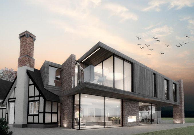
Modern extension to a historic building in the Green Belt

Client: Private Budget: £500k Sector: Residential