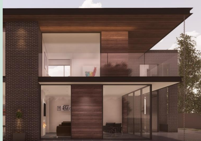
Modern extension in Conservation Area – Planning Approved

Client: Private Budget: £500k Sector: Residential