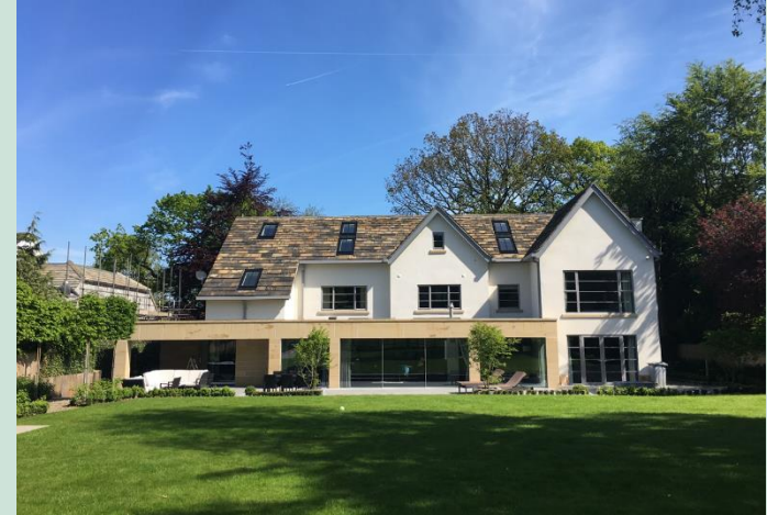
Extension & Remodel, Alderley Edge – Complete

Client: Private Budget: £1.5m Sector: Residential