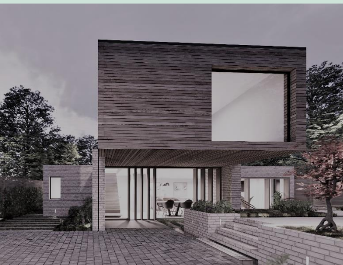
New House in Green Belt

Client: Private Budget: £850k Sector: Residential