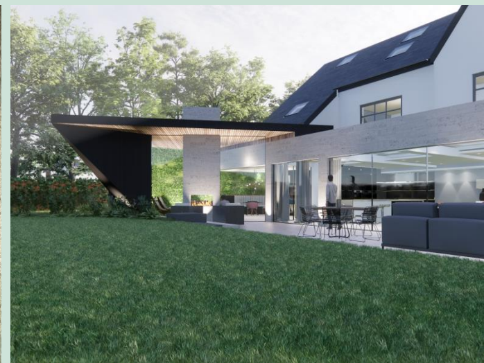
Extension & Remodel, Alderley Edge – Complete

Client: Private Budget: £2.5m Sector: Residential